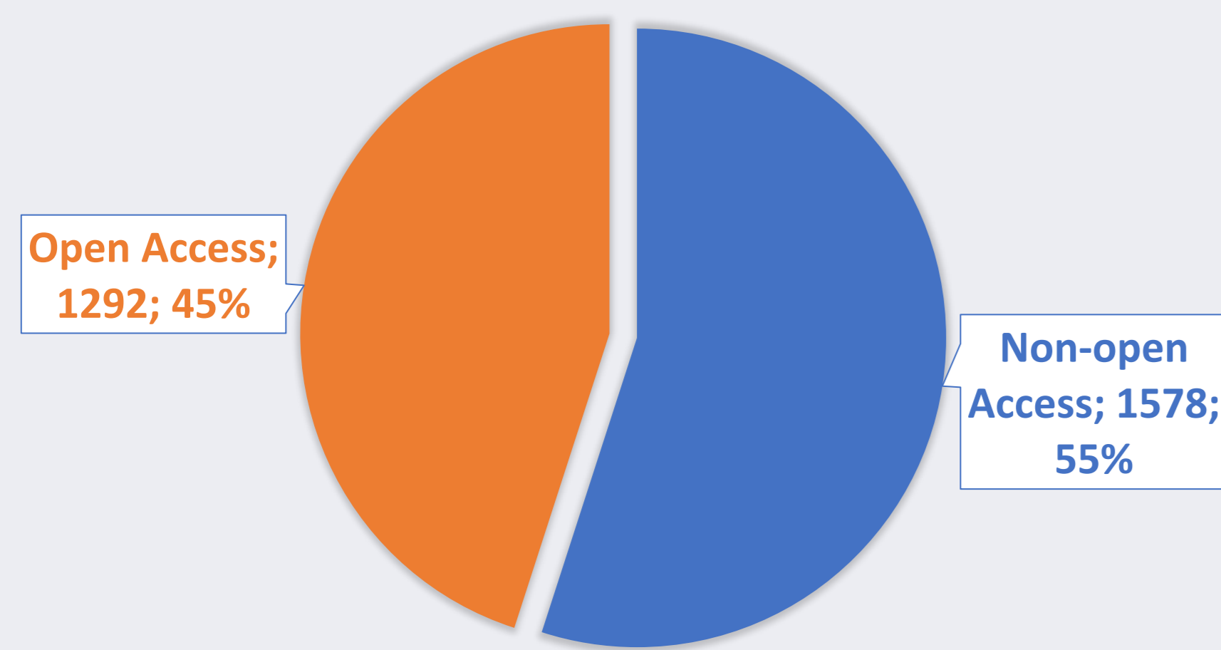
OA Publications by Year