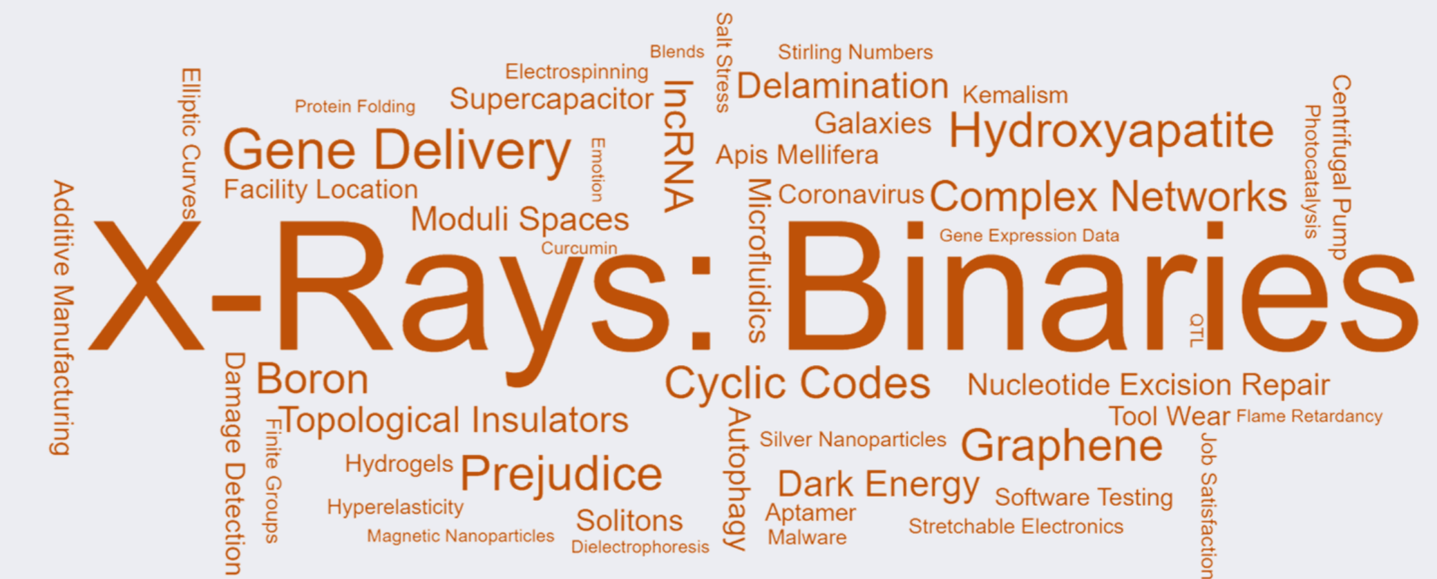
Top 50 keyphrases by relevance