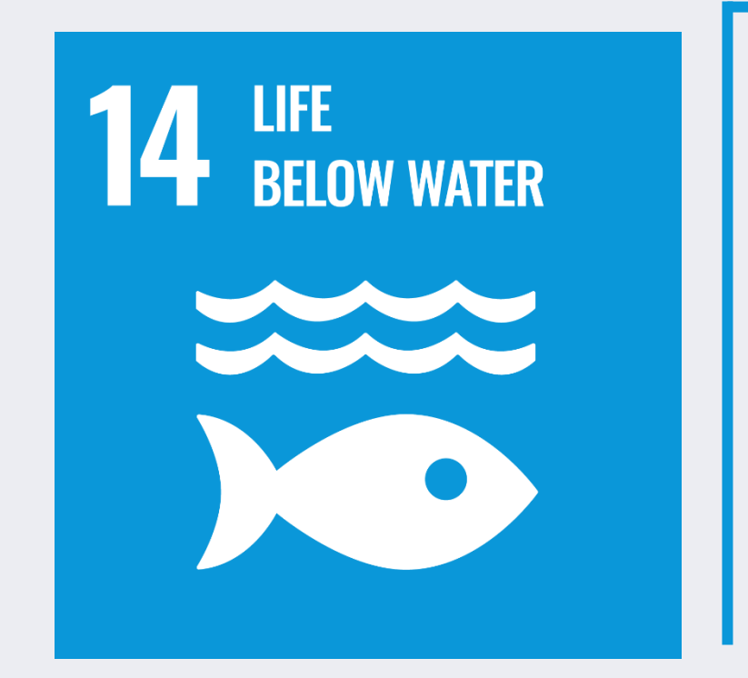
Careful management of this essential global resource is a key feature of a sustainable future